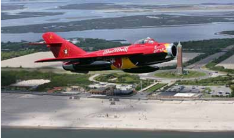
These pictures were contributed by Vince Lipovsky from the Jones Beach Air Show, NYC —